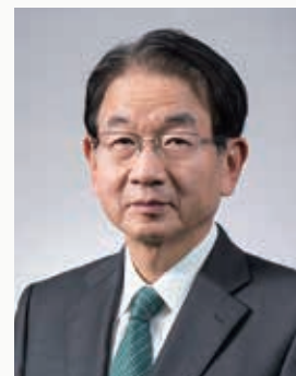
Representative Director, Chairman, President & CEO

We will update you on our progress as we meet new challenges.